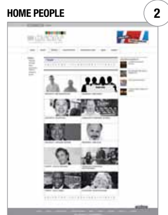
Section dedicated to people: architects, designers and athletes from all over the world or people mentioned in the articles.