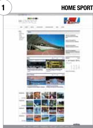
In this section it is possible to search through projects by sport (athletics, basketball, soccer, etc.)

Let's have a closer look now at the various sections of usa.spaziomondo.com