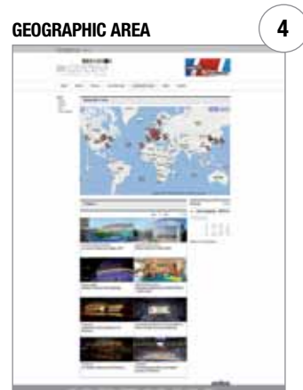
Section dedicated to the geographic location of the facilities analyzed using Google Maps.