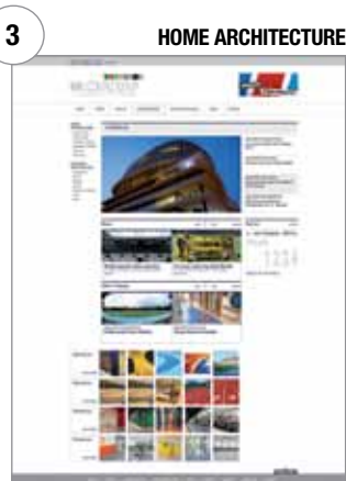
In this section it is possible to search through projects by type of architectural structure (indoor arenas, stadiums, etc.)