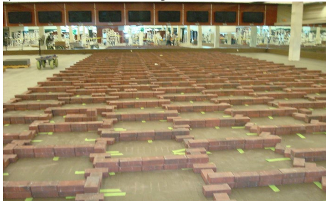
10 mm Sport Tile Installation utilizing 2 bricks head seam 1 brick side seam

NOTE: The above listed quantities are merely suggestions. Specific site and environmental conditions could necessitate additional or less bricks on the seams. Enough bricks should be used to effectively keep the material flat in the adhesive for the required amount of time listed above. Never use pieces of wood, boxes of other materials, sandbags, cinder blocks or any other substitute to weight the seams. See photo below showing placement of bricks on seams.