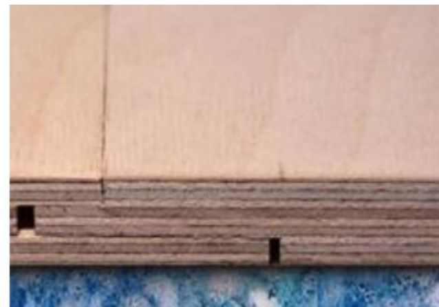
VINYLSPORT M 7mm