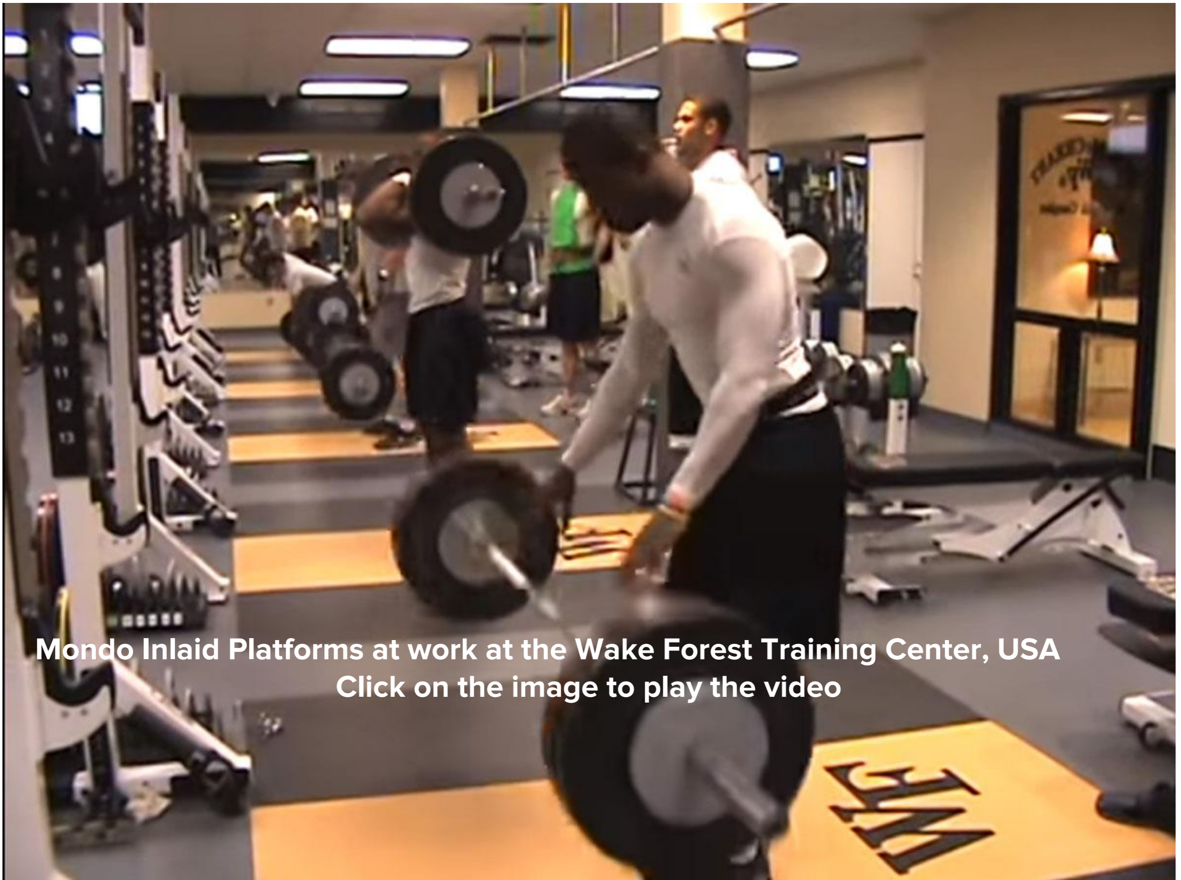
Mondo Inlaid Platforms at work at the Wake Forest Training Center, USA Click on the image to play the video