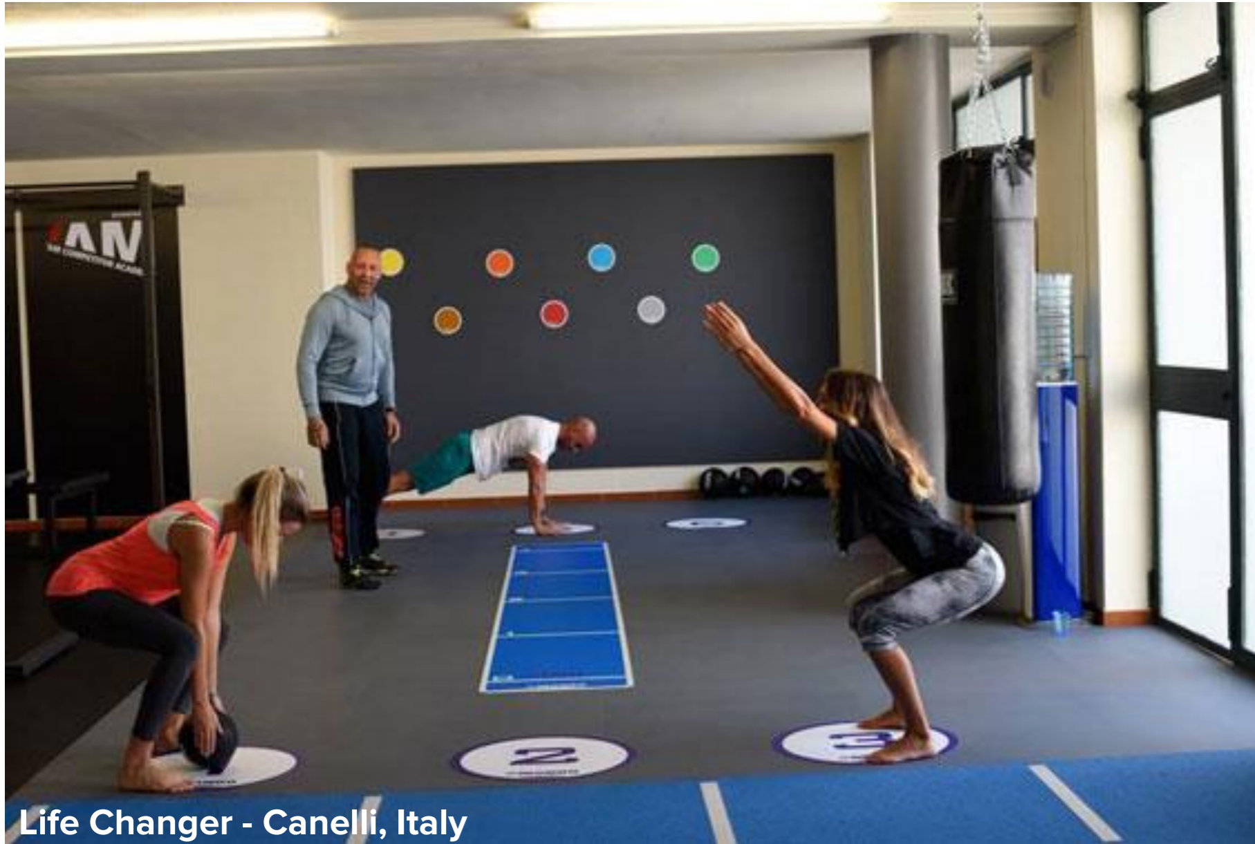
Life Changer - Canelli, Italy