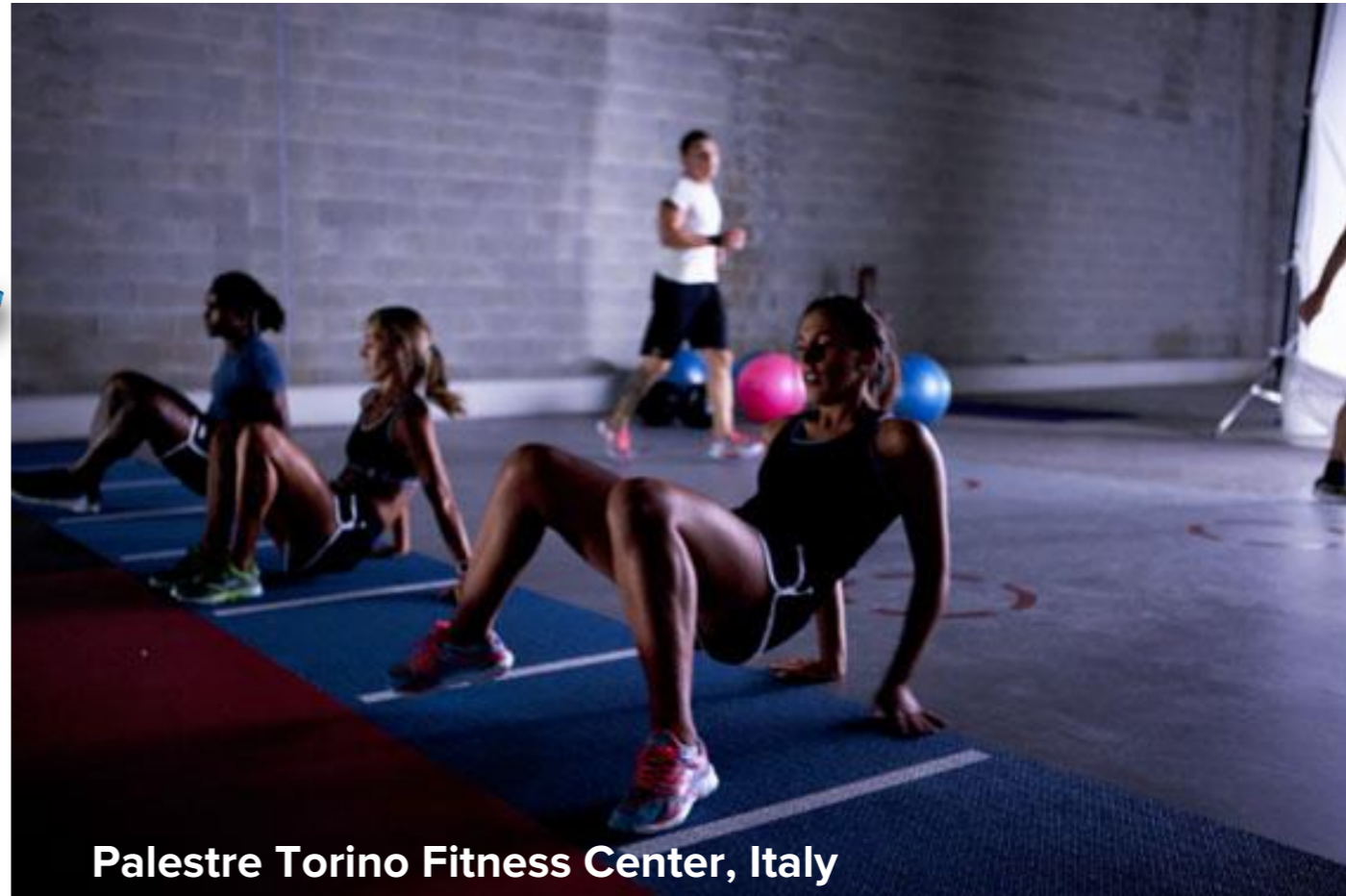
Palestre Torino Fitness Center, Italy

Perfect for: Functional, Athletic training, Sprint exercises and jumps