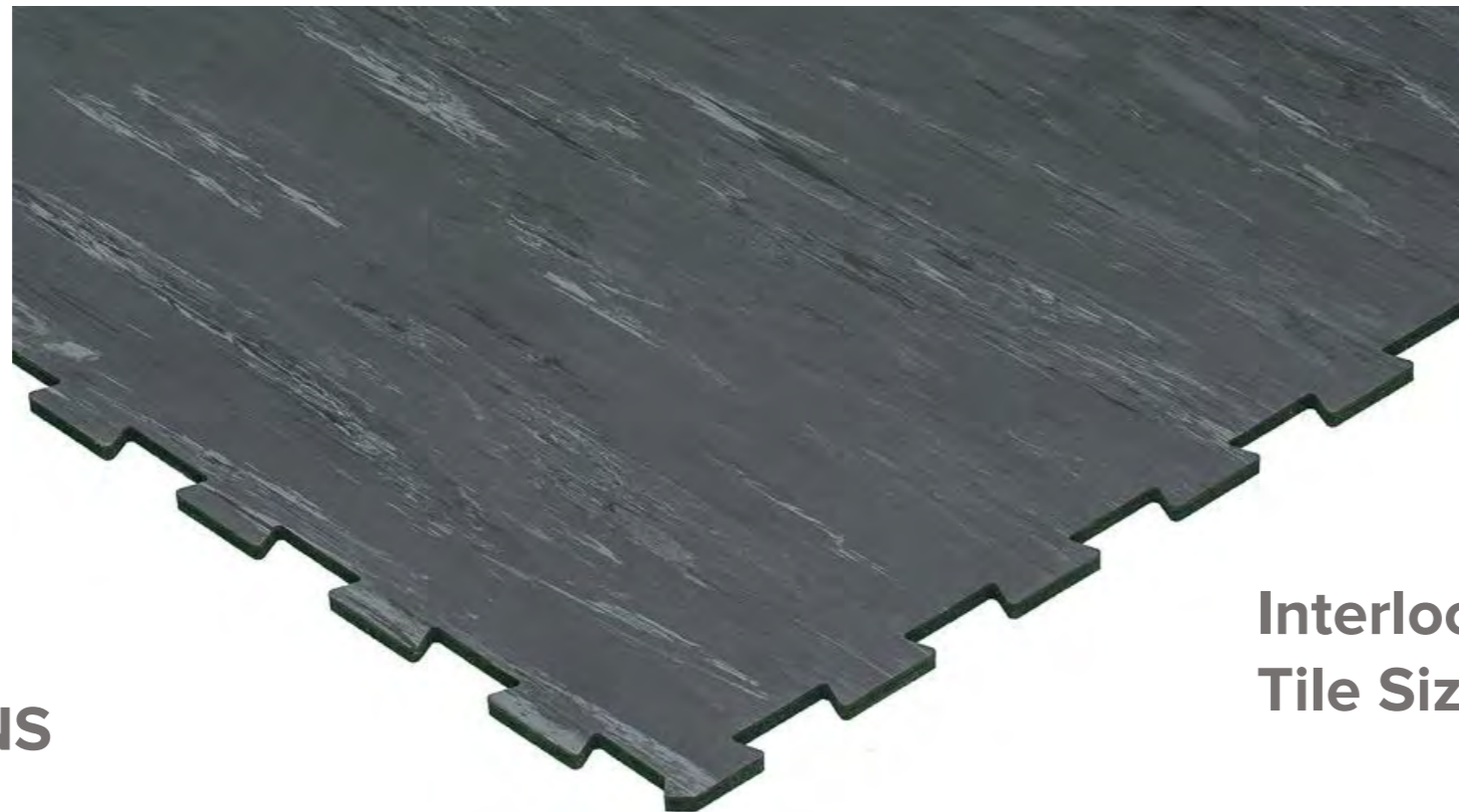
Interlock Tiles Tile Size: 90 x 90 cm

Zone-it Interlock allows easy and fast procedures of application and removal and represent an ideal solution for renovations, high moisture conditions and temporary applications.