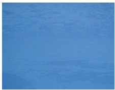
A25 ROYAL BLUE